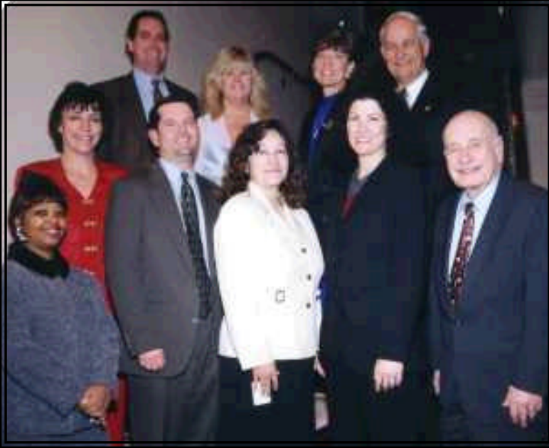
RIMS-LA BOARD 2002